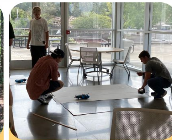
➔ Engineering & Technology