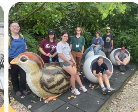
➔ Wildlife Management