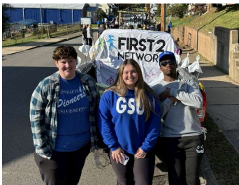
First2 Glenville students with their float "STEM and Bones" at the Glenville Homecoming Parade